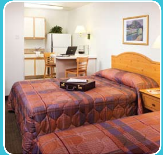
Typical Conversion Guestroom