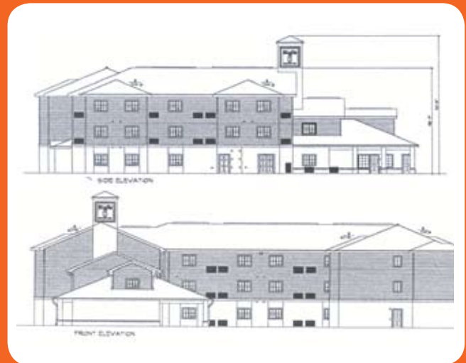
Prototype Building Elevations